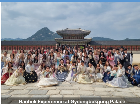
Hanbok Experience at Gyeongbokgung Palace