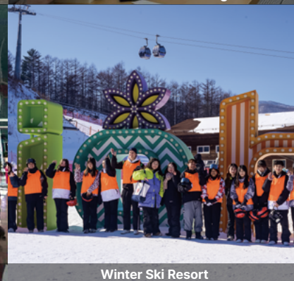
Winter Ski Resort