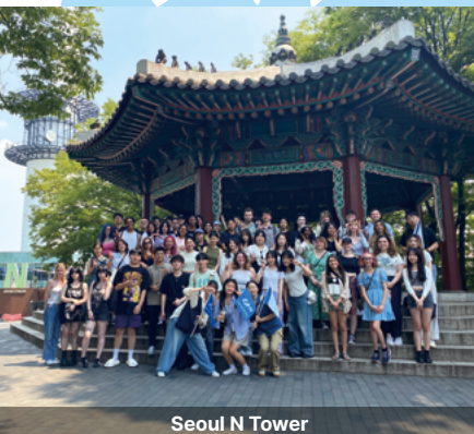
Seoul N Tower