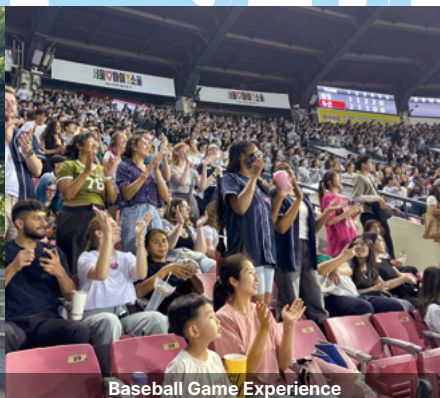
Baseball Game Experience